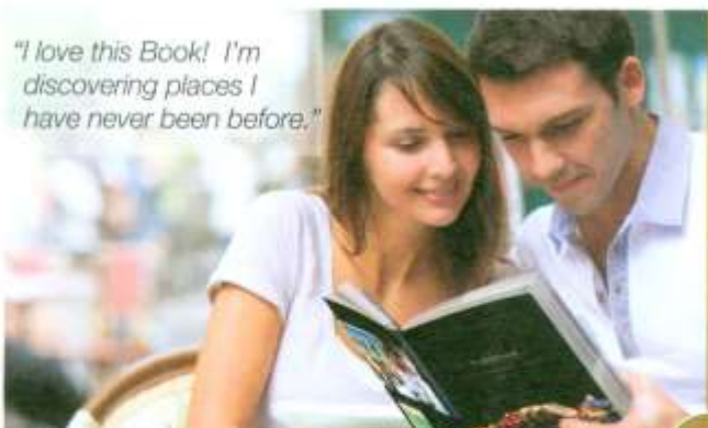
The entertainment Book

"I love this Book! I'm discovering places I have never been before."