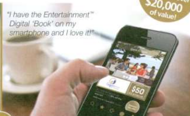
The entertainment Digital Membership

"I have the Entertainment™ Digital 'Book' on my smartphone and I love it!"